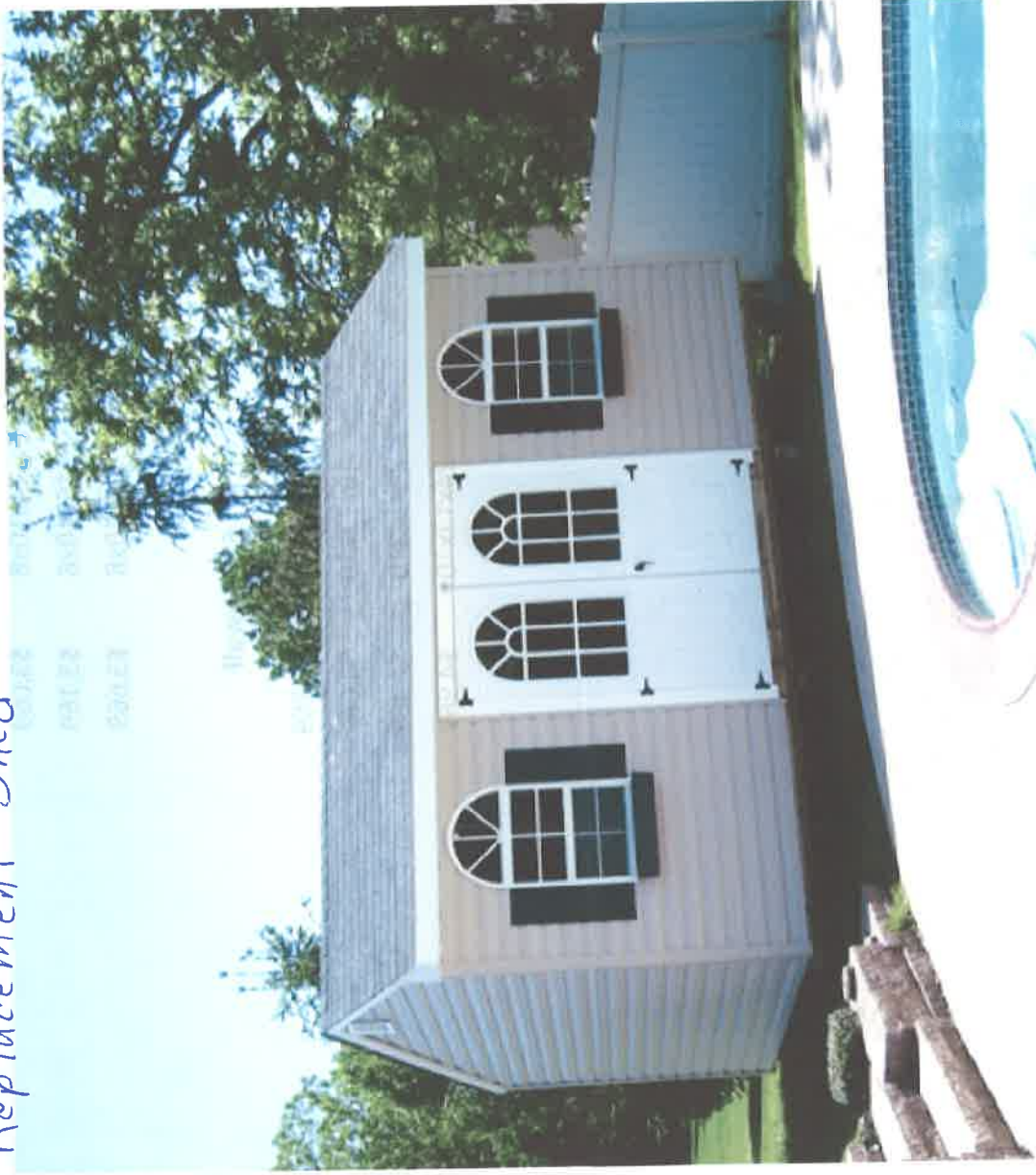
*Building Shown with Optional Features